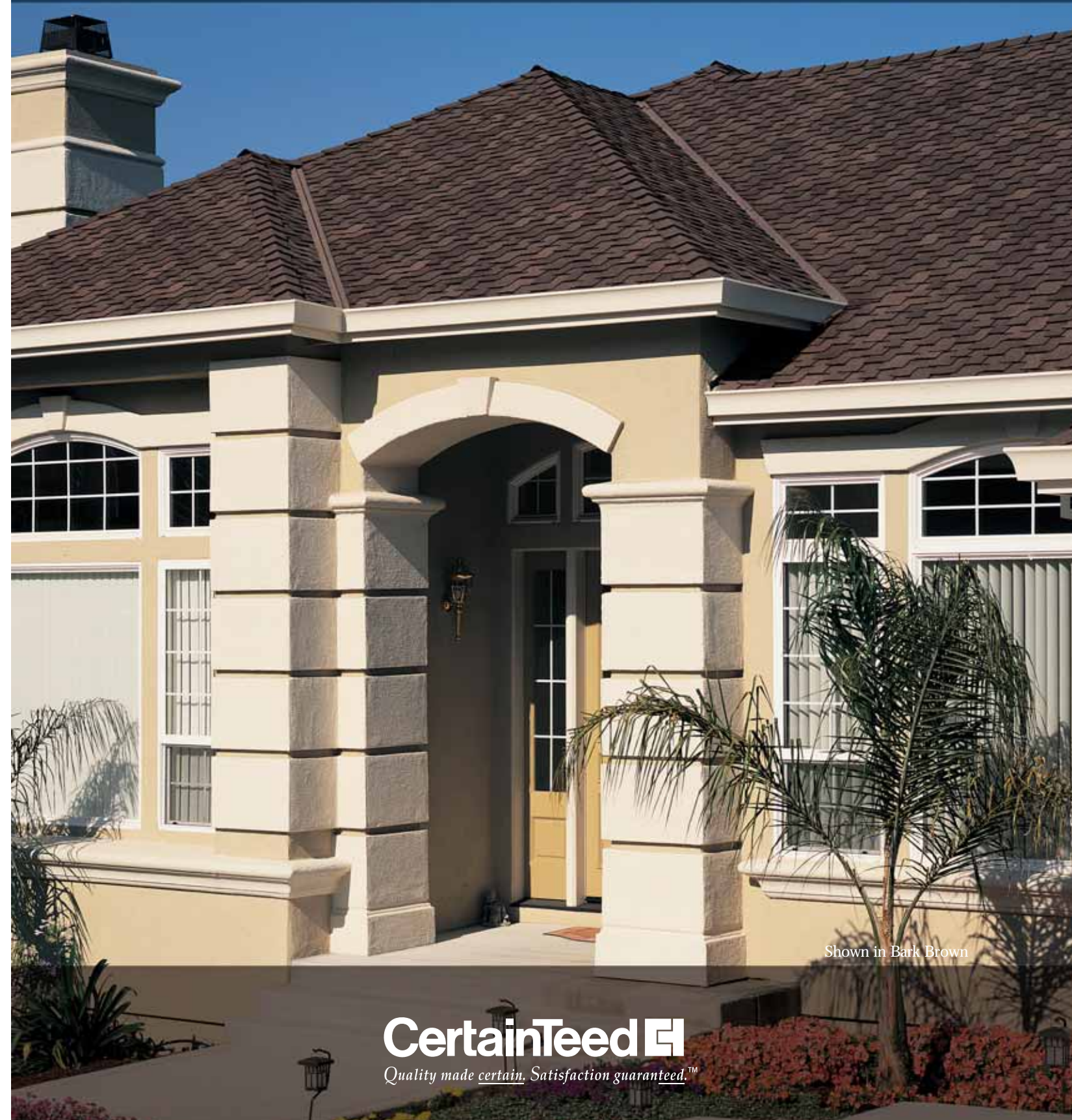
Shown in Bark Brown

CertainTeed Quality made certain. Satisfaction guaranteed.™